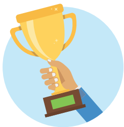
Reward Outstanding Work

Utilize the Employee Rewards Software to help strengthen your company culture, overall productivity, and results. This is the perfect tool to help retain employees, reduce costs related to turnover, improve day-to-day productivity, and in many cases dramatically enhance your employee and customers' experience. The best part, you get it included automatically when you start using the base features of the BIStrainer system.