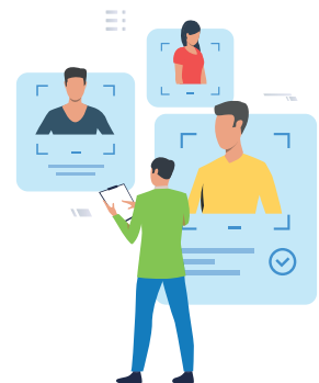
Recognize Top Team Members